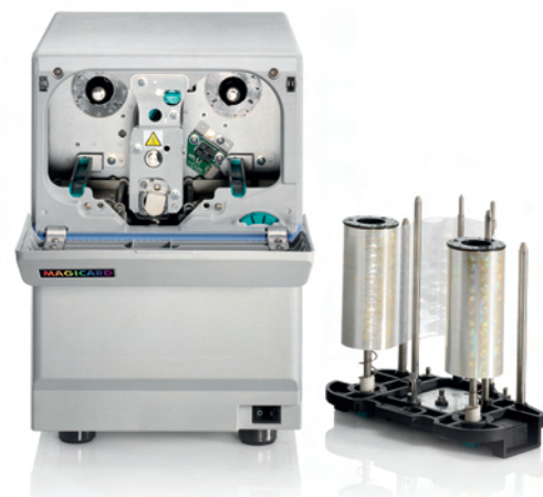
Easy load lamination system

Unlike any other card laminator, the Magicard Prima Inline Lamination Unit laminates in portrait mode, allowing it to reach impressive speeds of 20–35 seconds per card, depending on settings.